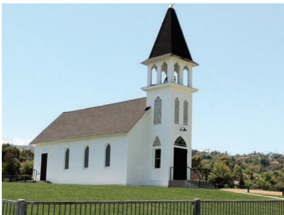
St. Peter's Episcopal Church. Green Hills Memorial Park, Rancho Palos Verdes, CA. May 2012.

A ribbon-cutting ceremony took place in June and the church is now open for the public to see. Green Hills encourages the public to visit and enjoy this community treasure that has been restored to its former glory. The City of Rancho Palos Verdes is proud to have an organization in town that has given back to the community through this wonderful deed. Green Hills graciously took on the commitment to restore and preserve the St. Peter's Episcopal Church for the benefit of the community and future generations. Green Hills Memorial Park is the appropriate, final resting place for St. Peter's Church.