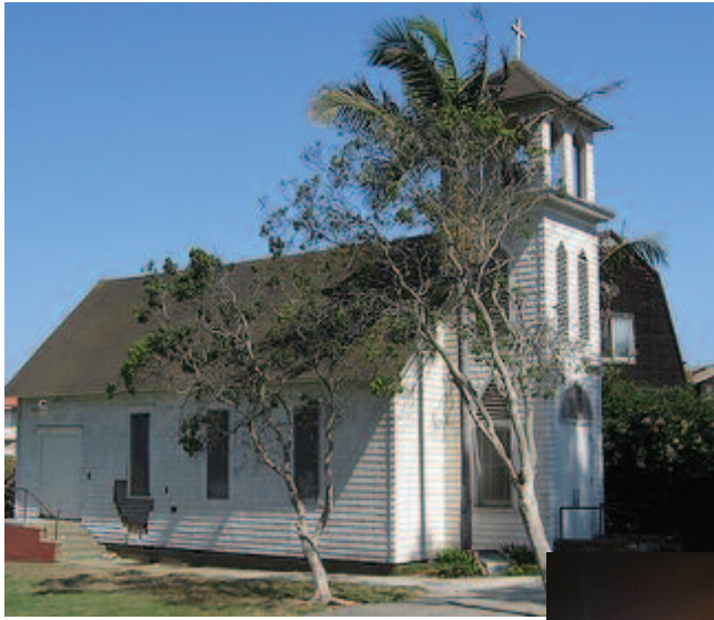
St. Peter's Episcopal Church. Harbor View Cemetery, San Pedro, CA. November 2008.

Sermons in Church can often be moving, but last October it was St. Peter's Church itself that was on the move! Constructed in 1884, St. Peter's Episcopal Church was San Pedro's first church. Originally built at Nob Hill on Beacon Street between 2nd and 3rd Streets, St. Peter's served the little port town of San Pedro at this original location for 20 years. In 1904, the church was moved to the Vinegar Hill section of San Pedro at 10th and Mesa Streets when the town was rearranged to make room for the LA Harbor port expansion. The church continued to serve its parishioners and the community, but after 50 years the congregation had outgrown its little church. Although the congregation of St. Peter's Episcopal Church built a new structure, there was an appreciation for the church's history; so, rather than demolishing the old church, it was donated to the City of Los Angeles, and moved to Harbor View Cemetery.