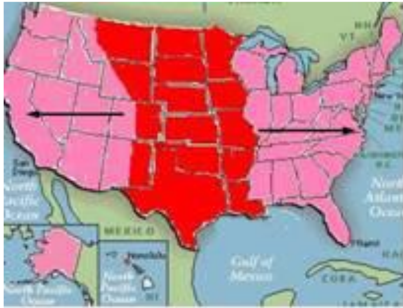
Coyote dispersal range