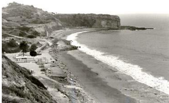
Abalone Cove looking east toward Portuguese Point