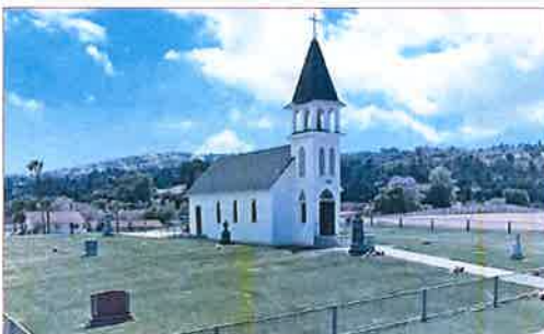
Historic Church Yard