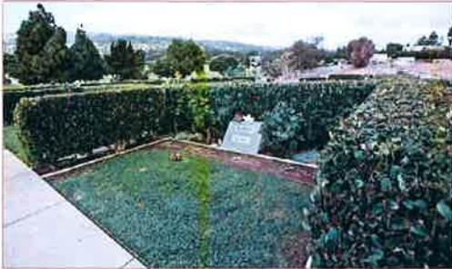
Private Garden Area